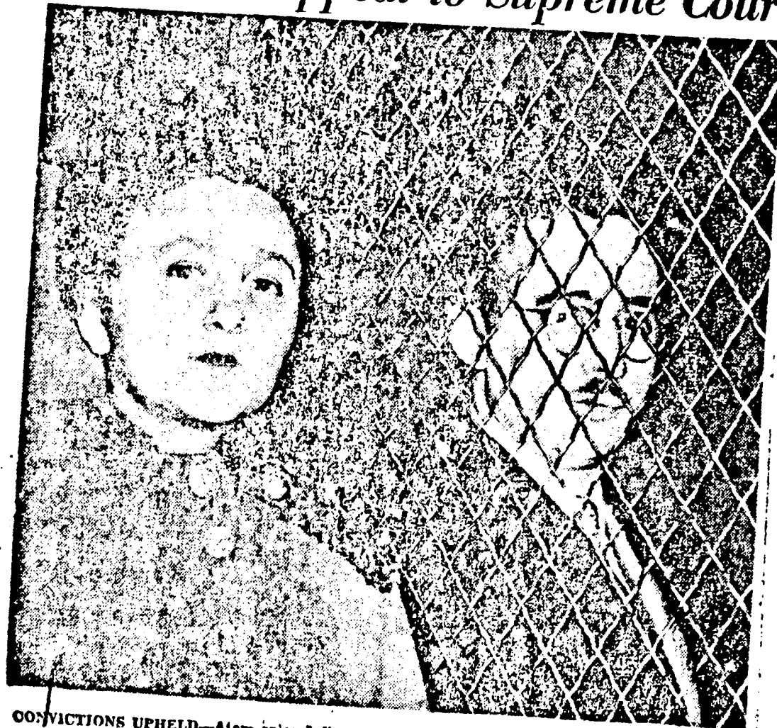
CONVICTIONS UPHELD—Atom spies Julius and Ethel Rosenberg on way to jail last year